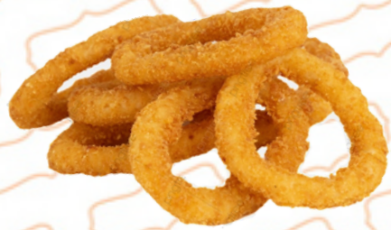
ONION RINGS (5 pcs)