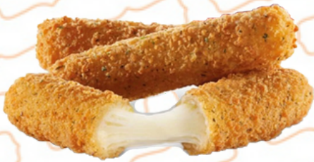
MOZZARELLA STICKS (2 pcs)