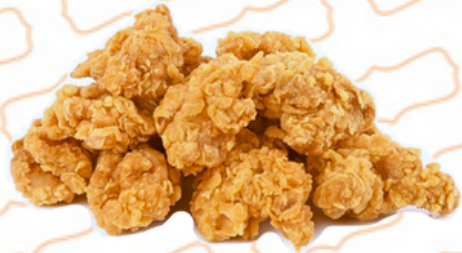
CHICKEN POPS (3 pcs)