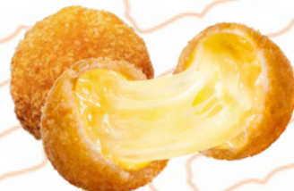
CHEDDAR BALLS (2 pcs)