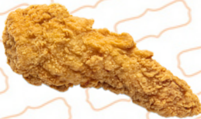
CHICKEN TENDER (1 pc)