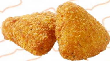
JALAPEÑO BITES (2 pcs)